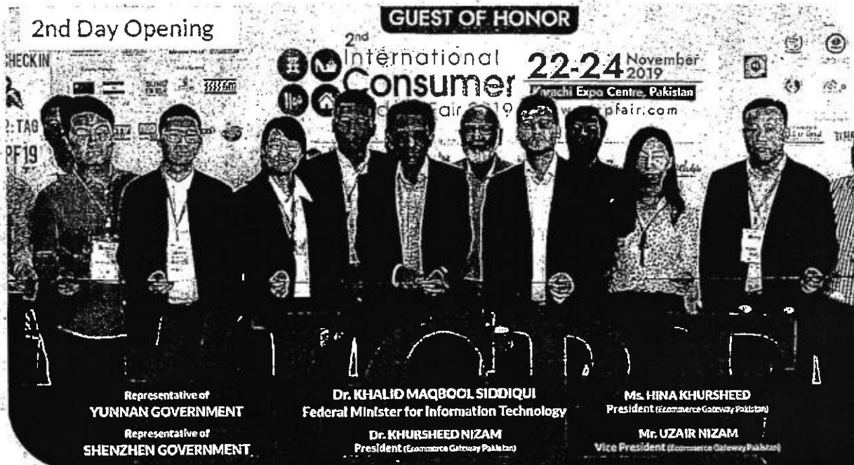
Representative of YUNNAN GOVERNMENT Representative of SHENZHEN GOVERNMENT