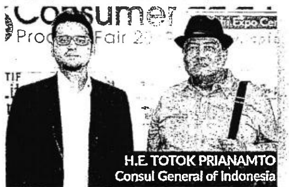
H.E. TOTOK PRIANAMTO Consul General of Indonesia